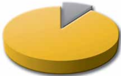
■ Cash ■ Shares