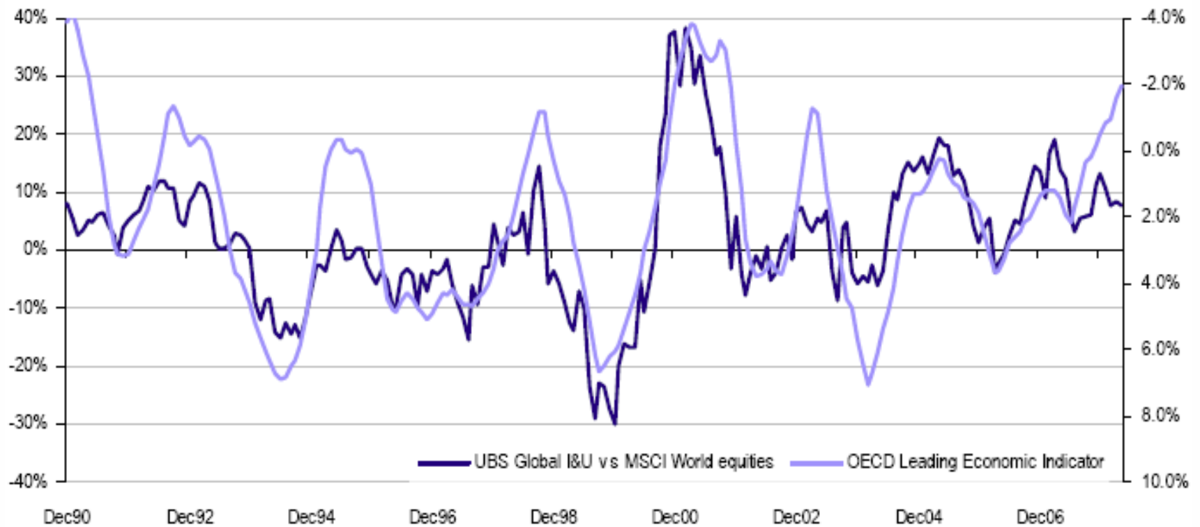
UBS Infrastructure Index Relative Performance Vs. World Equities & Forward Indicators Of Economic Activity

In periods of weak or declining economic activity infrastructure outperforms the broad market index